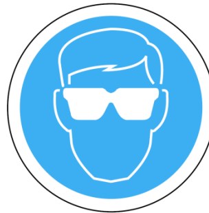
Eye protection must be worn