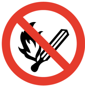
Smoking and naked flames forbidden

All substances require to be assessed in accordance with the Control of Substances Hazardous to Health Regulations before they may be used.